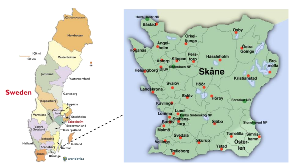
Figure 1: Map of Sweden (left) and Skåne (right). The maps were collected from Worldatlas (<a href="http://www.worldatlas.com/webimage/countrys/europe/lgcolor/secounties.gif">http://www.worldatlas.com/webimage/countrys/europe/lgcolor/secounties.gif</a>) and Naturproduktion Bengt Hedberg (<a href="http://www.naturproduktion-bh.se/maps/skane.gif">http://www.naturproduktion-bh.se/maps/skane.gif</a>).