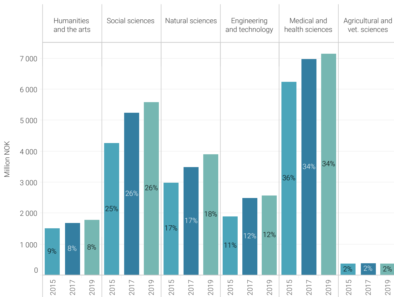
Current expenditures on R&D in the higher education sector by field of R&D. 2015, 2017 and 2019. Fixed 2015-prices. Mill. NOK.

In recent years, there have been many mergers of educational institutions in the higher education sector. But the sector included 32 educational institutions and 6 health trusts both in surveys for 2017 and 2019. Two educational institutions have been granted university status since the previous survey in 2017: the University of South-eastern Norway and OsloMet - the metropolitan university. In 2019, Westerdal's Oslo ACT has become part of Kristiania University College, while the University College of Norwegian Correctional Service (KRUS) has been included in the R&D statistics for the first time.